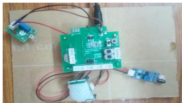
Fig: Transmitting section

Our proposed system consist of two modules, one is transmitting module and another one is receiving module. Transmit side LoRaWAN equipped with microcontroller this module connect with sensors and collecting information from sensors. Receiving section LoRaWAN is equipped processor with cloud computing. Transmitting section collect information from sensors and it will communicate to the receiving section. By using cloud computing with LoRaWAN gateway .By means of internet we can easily monitoring sensing information everywhere in the world.