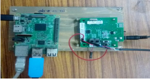
Fig: Receiving section