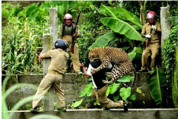
Fig:3-Animals Entering in to the land and attacking humans