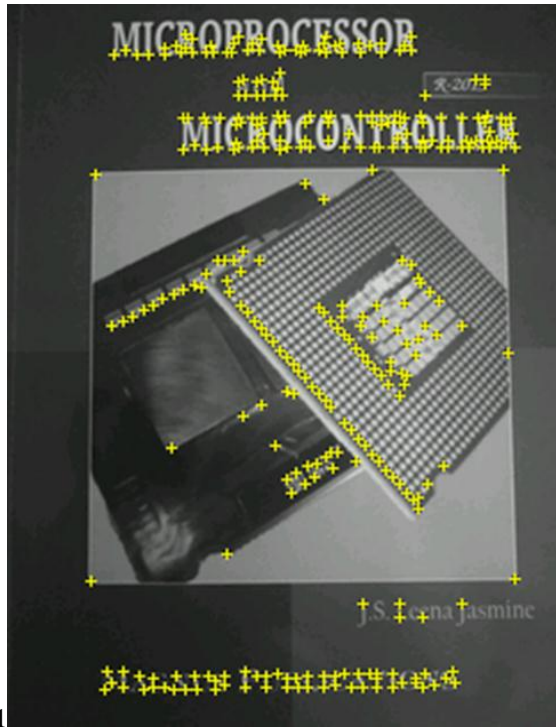
FEATURED IMAGE OF TARGET