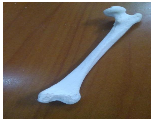
Fig.2.3D Printed Bone